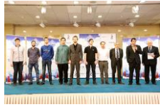
AEROFLOT OPEN 2017