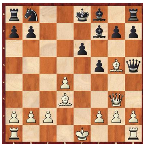
White to play