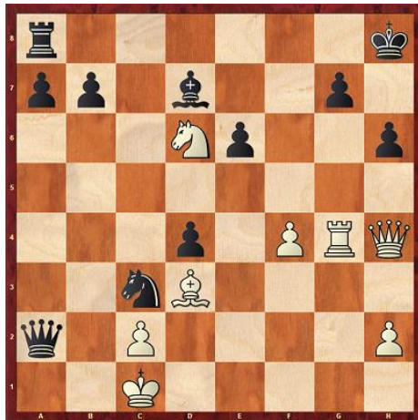
White to play

In February Fun Zone we prepared 4 quick Mate in 2 positions. How fast can you solve them?