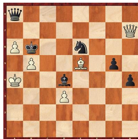
White to play