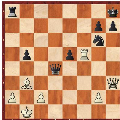
White to play