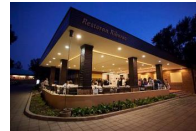
EUROPEAN SENIOR TEAM CHESS CHAMPIONSHIP